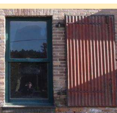
Legacy Renovation, experts in historic window restoration, is carefully rebuilding and repainting the wood windows in the NWIC Building. Work is expected to be complete by the end of November.