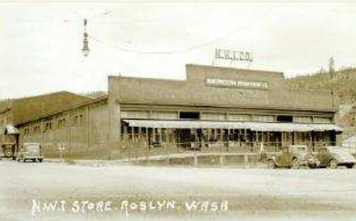
"Northwestern Improvement Company Store" (1935).