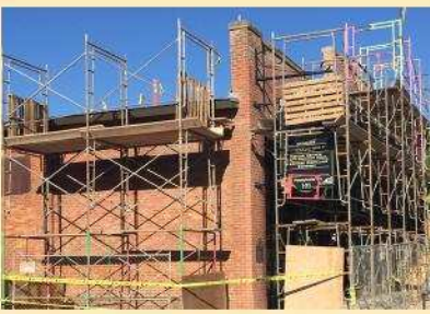
Masonry repointing of the NWIC Building is complete. VanWell Masonry, based in Snohomish, Washington, provides full-service masonry capabilities with a particular expertise in historic masonry repair and restoration. Their skilled craft work will ensure that the NWIC Building will stand the test of time.