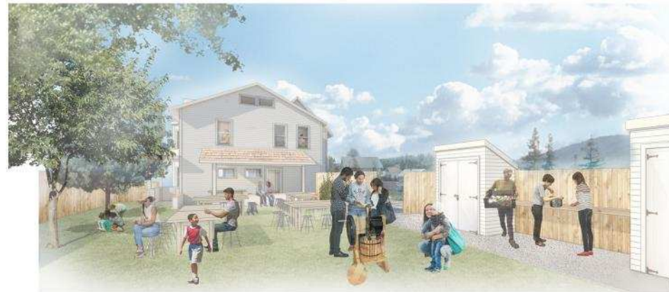
A covered porch, tool sheds and sturdy furniture transforms the backyard into a place for creative outdoor activities and events.