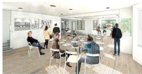
Open classroom and exhibit space with movable tables and chairs provides a flexible gathering place for learning, display and creative activities.

After sitting vacant for several years, the RDA acquired the property in 2010. Volunteers cleared debris from the house and yard and installed temporary windows to help preserve the structure. Public engagement efforts to realize this significant project date back to 2011, when the RDA invited the UW Storefront Studio explored and presented a range of ideas for reuse. In 2016, the RDA organized a visioning workshop that helped shape numerous ideas for the Center. SHKS Architects developed the design to retain the building's historic character while adapting it for creative activities and programs.