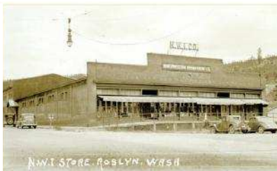
"Northwestern Improvement Company Store" (1935).