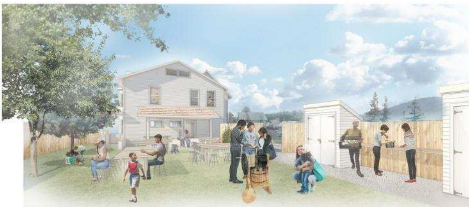
A covered porch, tool sheds and sturdy furniture transforms the backyard into a place for creative outdoor activities and events.