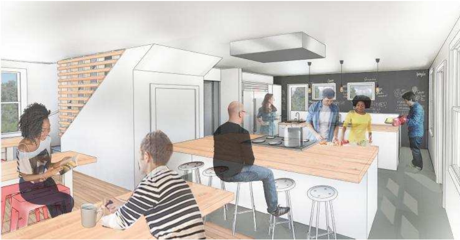
A demonstration kitchen provides a place to celebrate and share Roslyn's rich ethnic culinary traditions.