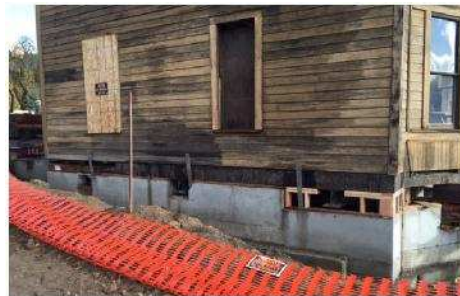
The Roslyn Creative Center is safely back on the ground, resting on a new concrete foundation.