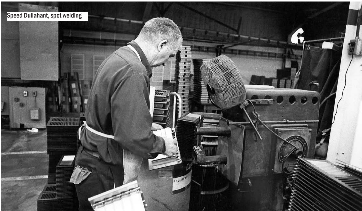
Employees working at various tasks and machinery when Shoemaker Manufacturing was located in the NWIC Building in Roslyn.