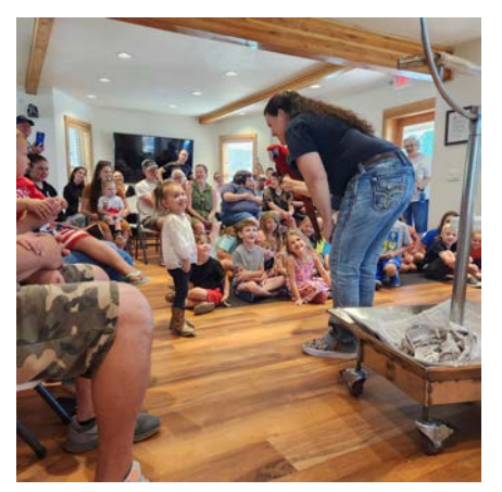
Parrot Show at Roslyn Creative Center