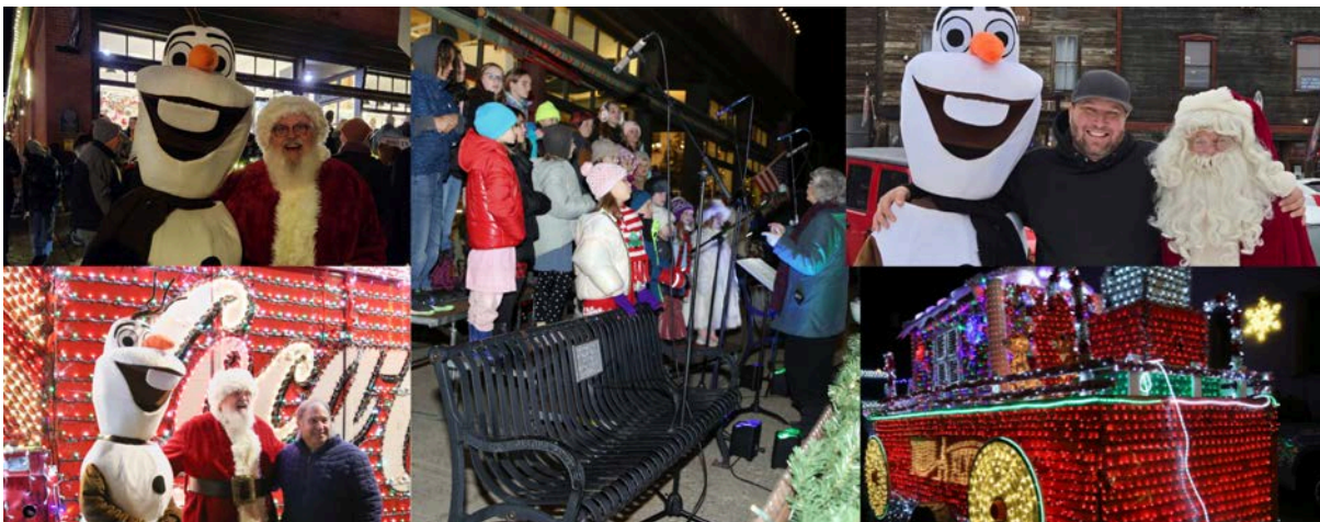
Old Town Christmas