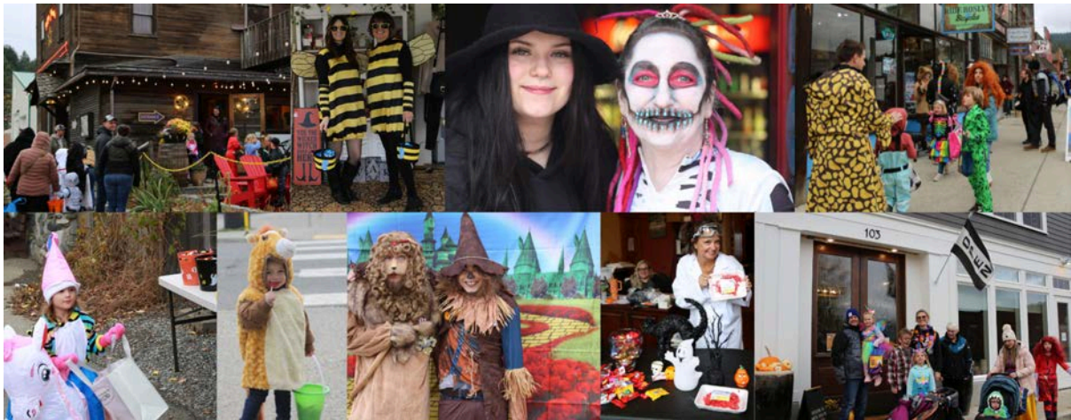
Boo-tiful Downtown Trick or Treats