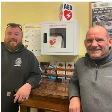
RDA Gifts City of Roslyn 3 AED's

Oh, what a wonderful year 2024 was! A heartfelt thank you to the incredible businesses, volunteers, community organizations, and the city that make Roslyn a truly special place. As we look forward to 2025, let us continue to thrive and cherish each moment in all our endeavors.