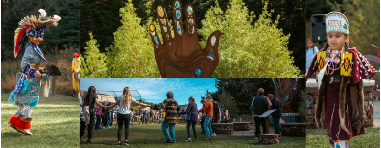
Sacred Acknowledgment Yakama Nation Creators Law Celebration