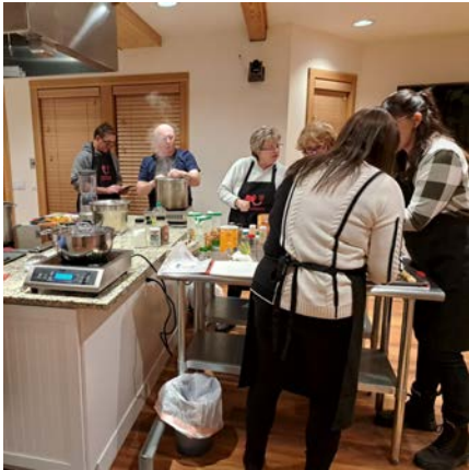
Cooking Classes at Roslyn Creative Center